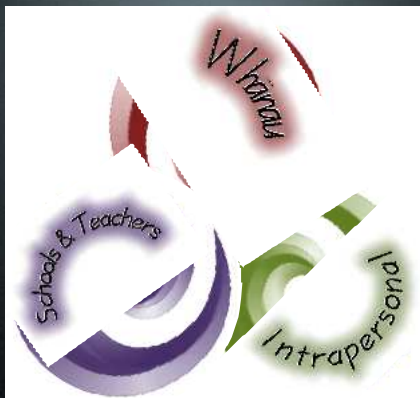
Toru Koru Model