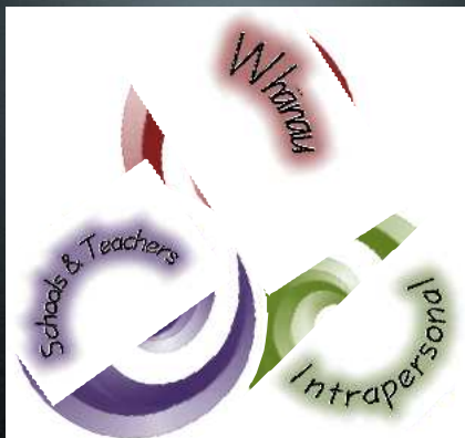
Toru Koru Model